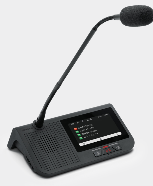
VIS-MAU-T Multi-Media Wired Touch Screen Unit